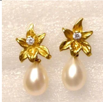
T12-E07 18K orchid earrings with .20 ct. diamonds and freshwater pearl drops. $1500