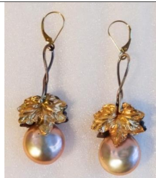
T14-E17 14K and sterling ivy leaf earrings with pink freshwater disc pearls. $1800.