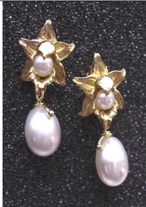
T12-E01 18K orchids with fresh- water pearls and drops. $1800