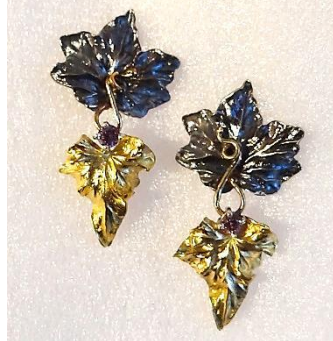
T14-E08 Sterling and 18K ivy leaf earrings with .35 ct Spinel. $1300