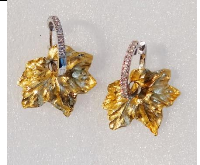
T14-E06 14K hoops with diamonds and removable 18K ivy leaf dangles. $2000