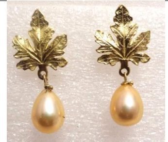
T12-E10 18K maple leaf earrings with golden peach freshwater pearls. $850