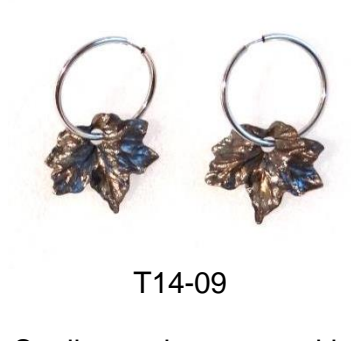
T14-09 Sterling hoops with removable ivy leaf dangles. $150