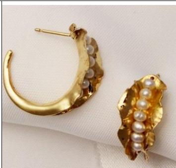
T13-E05 14K semi-hoop with freshwater pearls. $980.