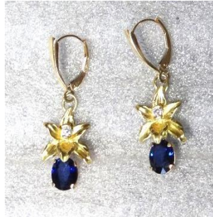
T14-E21 Orchid earrings with diamonds and diffused sapphires. $1800