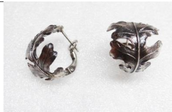
T14-E14 Sterling oak leaf semi- hoops $120.