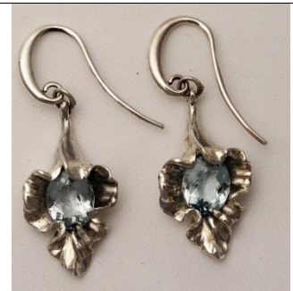
T13-E19 Sterling calla lily earrings with aquamarines. $350.