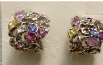
T13-E12 Sterling semi-hoop tapestry with multi fancy colored sapphires. $800.