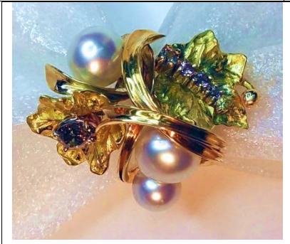
T18-R101 14k and 18K ring with .75ct. brown diamond, South Sea Pearls and spinel accents.