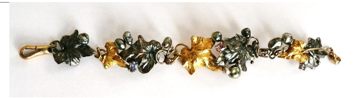
T14-B06 18K, 14K, and Sterling ivy leaf bracelet with 1.6 carat total weight Spinels. SOLD