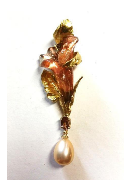
T19-N104 18K pendant 23 ct. carved Oregon sunstone, 1 ct. TW zircons and freshwater pearl drop.

Ocean green chalcedony pendant in 18K with freshwater chocolate pearl and faceted garnet briolette stamens. $3000.