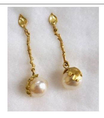
T19-E100 18K branch and leaf earrings with South Sea pearls. $950.