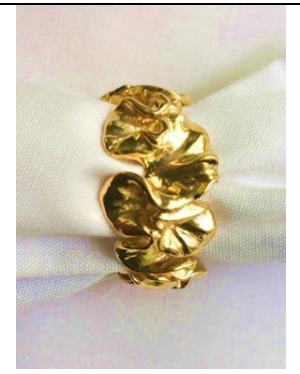
T18-R02 18K ruffle ring. $1900.