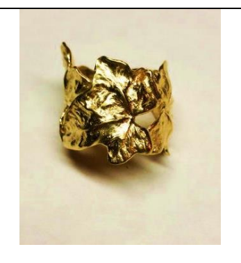
T16-R17 18K ivy leaf ring.