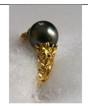
T12-R01 Tahitian pearl in 18K ivy mounting.