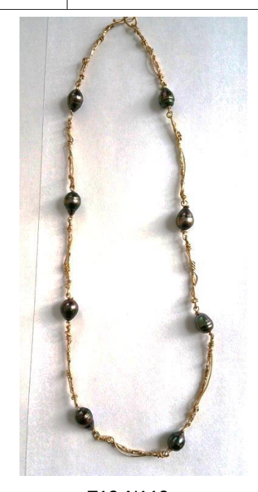
T19-N110 14K branch and vine link necklace with black Tahitian pearls.