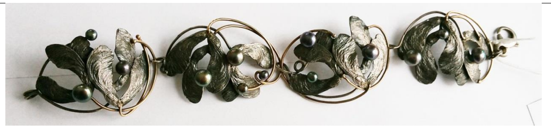
T14-B05 Sterling samara seeds with 14K stems accented with freshwater black pearls. $1600