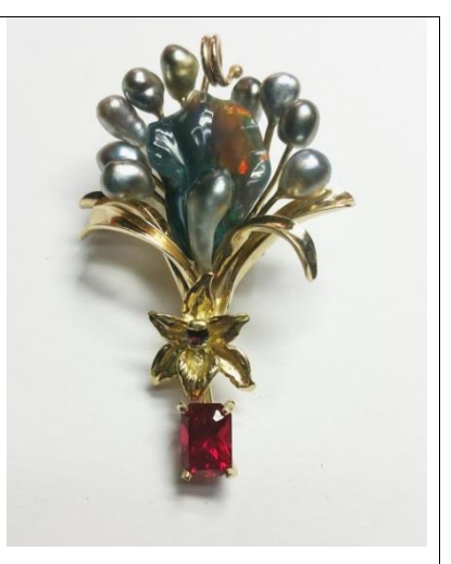
T18-N06 Carved Australian opal pendant with 1.68 ct. red spinel with Tahitian Keshi.