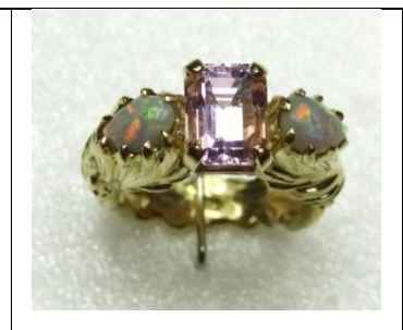
T15-R15 18K ring with 2.18 ct. kunzite and Australian opals.