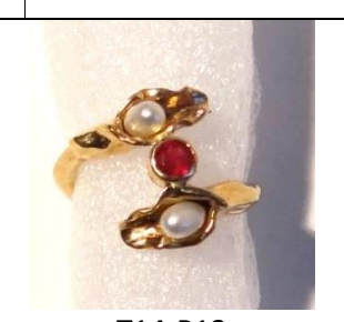
T14-R12 14K double call lily ring with pearls and 0.25 ct. ruby.