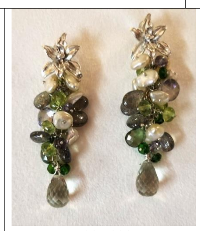
T20-E200 Sterling orchid earrings with multi genuine gemstone bead dangle.